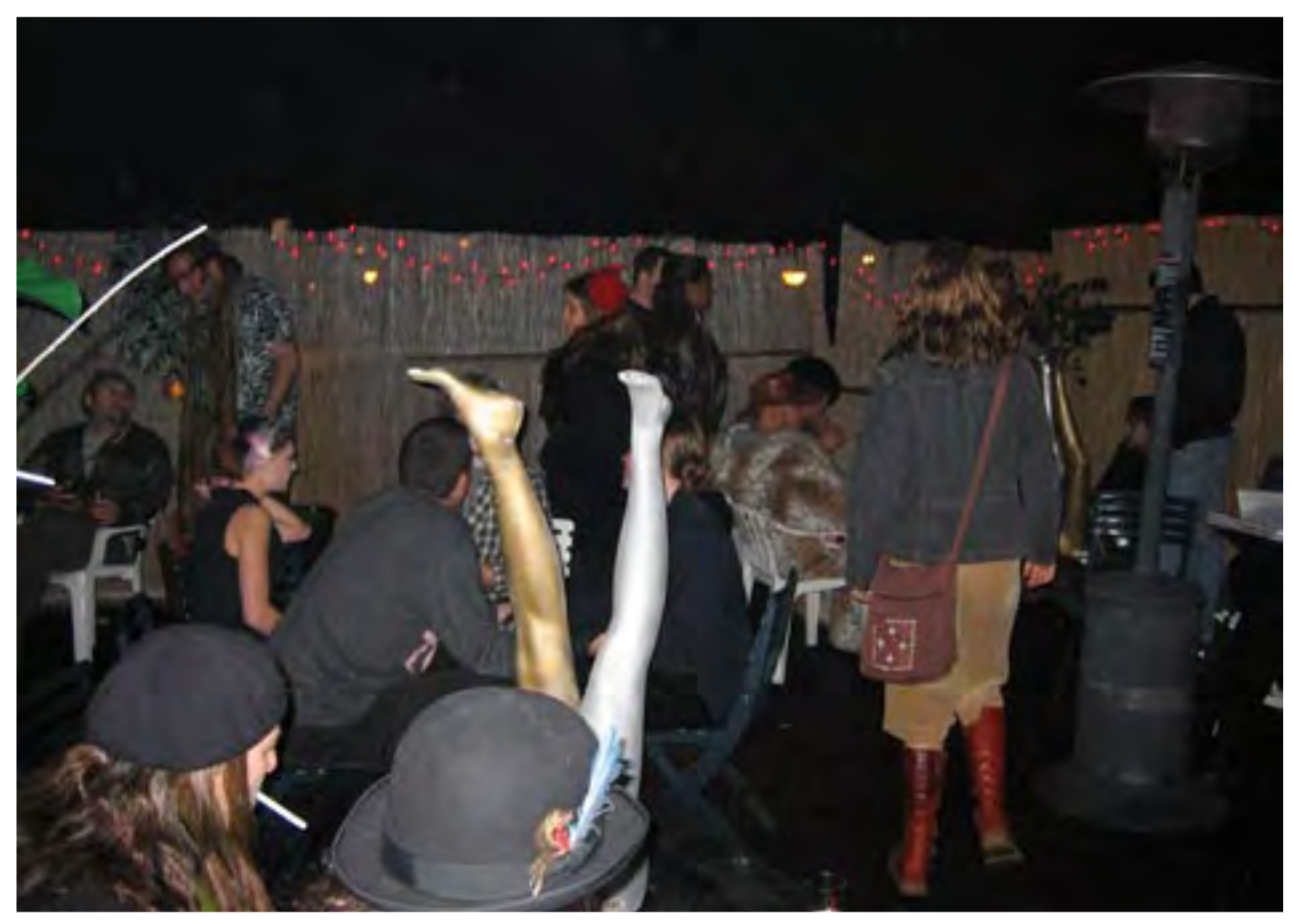
Open Air Lounge at the Anon Salon afterparty.

For more information, visit: <u>http:</u> //www.edwardianball.com/ and http:// www.anonsalon.com/