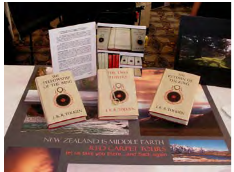
U.K. first editions of The Lord of the Rings, 1954-55.

ORC drew a good selection of scholars, panels covering themes in The Lord of the