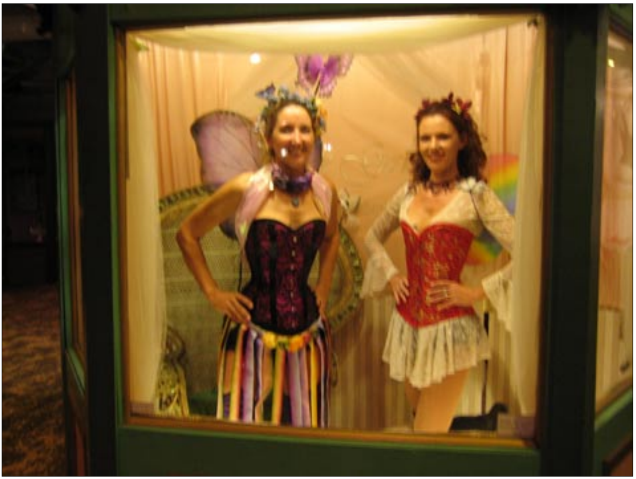
Dark Garden Window Models