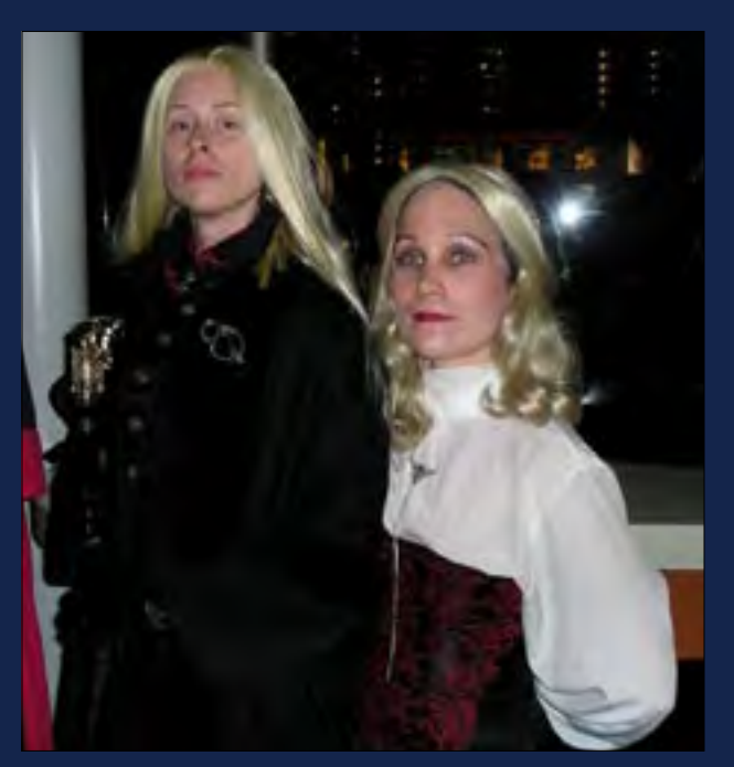
Lucius and Narcissa Malfoy

Many came in costumes representing or inspired by characters from the popular series.