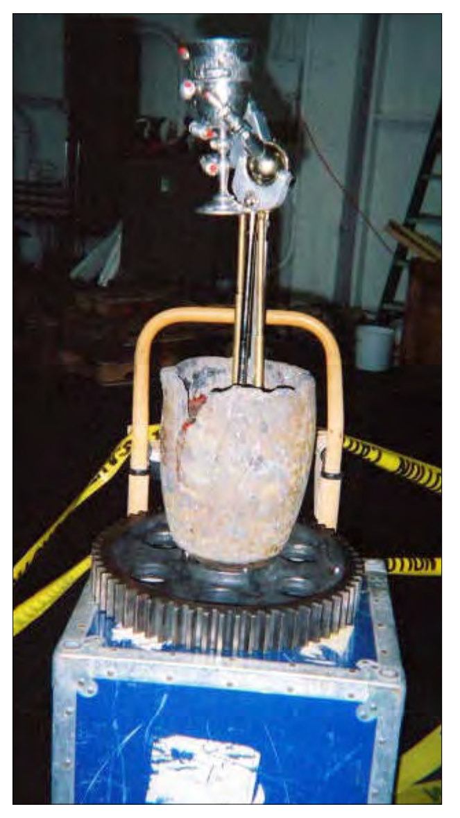
The ComBots Cup

provide consistency between events, and walls caused spectators to rush back to the battle, but small enough to be affordable to the average builder. At ComBots this year, there were nine Hobbyweight robots. For the RFL championship in the Hobbyweight