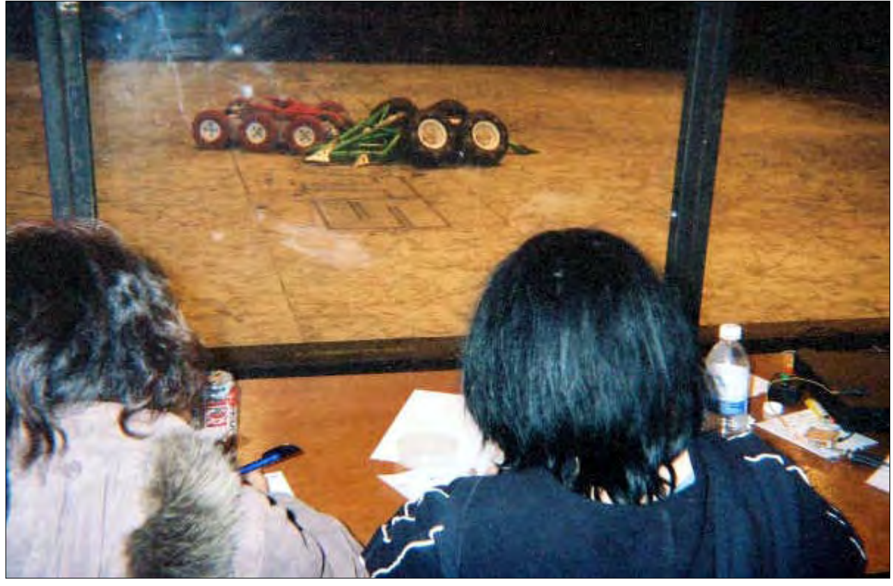
Sewer Snake and Karcus face off.

After the intermission, the stadium live," faced off in a "totally insane battle of lights were darkened, and with the speakers blaring the Star Wars "Rebel attack on the Death Star" symphony, the final round at it astride their wheeled steeds, waving and crown jewel of the competition began.