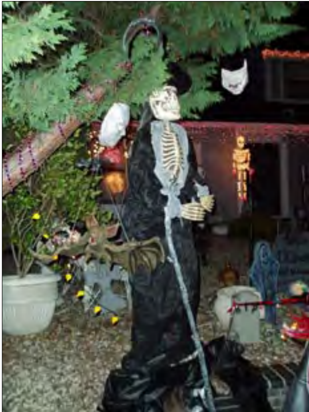
Foster City Skeletons Out and About

Halloween... Samhain... All Hallow's Eve. The one night of the year when the spirits of the dead and of the underworld are said to all come into our world and