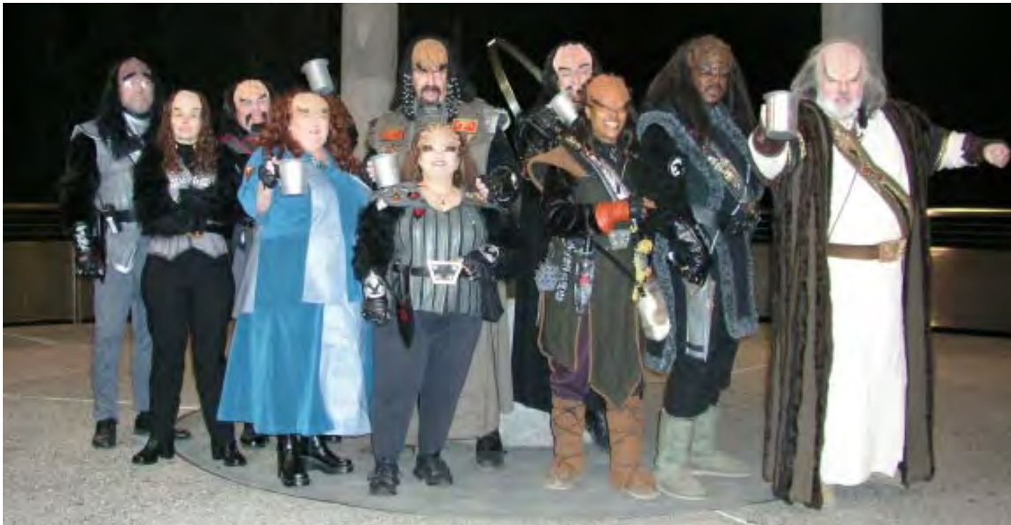
Klingons from the Starfire Region at the Mars Will Return Event at Chabot Space Science Center in October

And the rumor of the week was '80% of BASFA's members are away, waiting in line to vote at their polling places'.