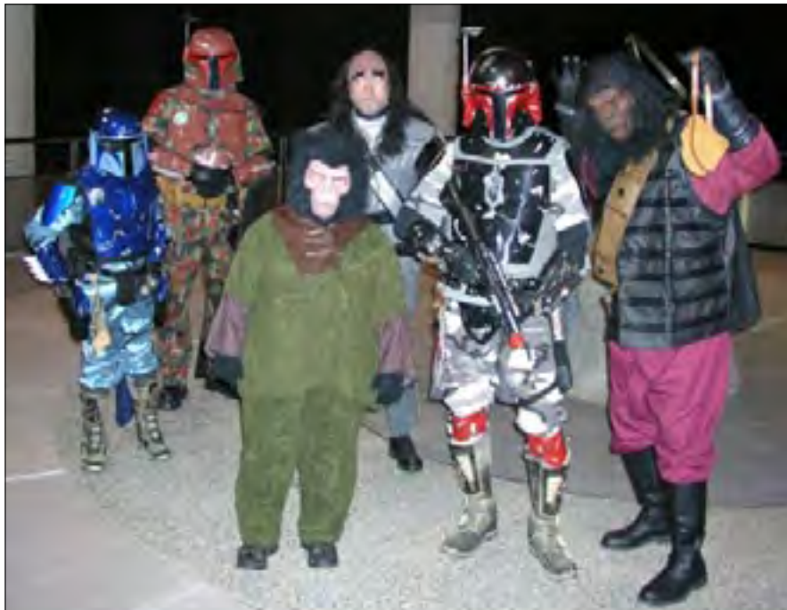
A mixed group of aliens at the Lunar Express Event at Chabot Space Science Center in October

BASCon is usually at the same time of year, which happens to be just before my birthday, so I’ve come to view it as a very nice birthday present – a chance to visit with old friends, let my hair down (metaphorically) and eat too many carbs. What can be better?