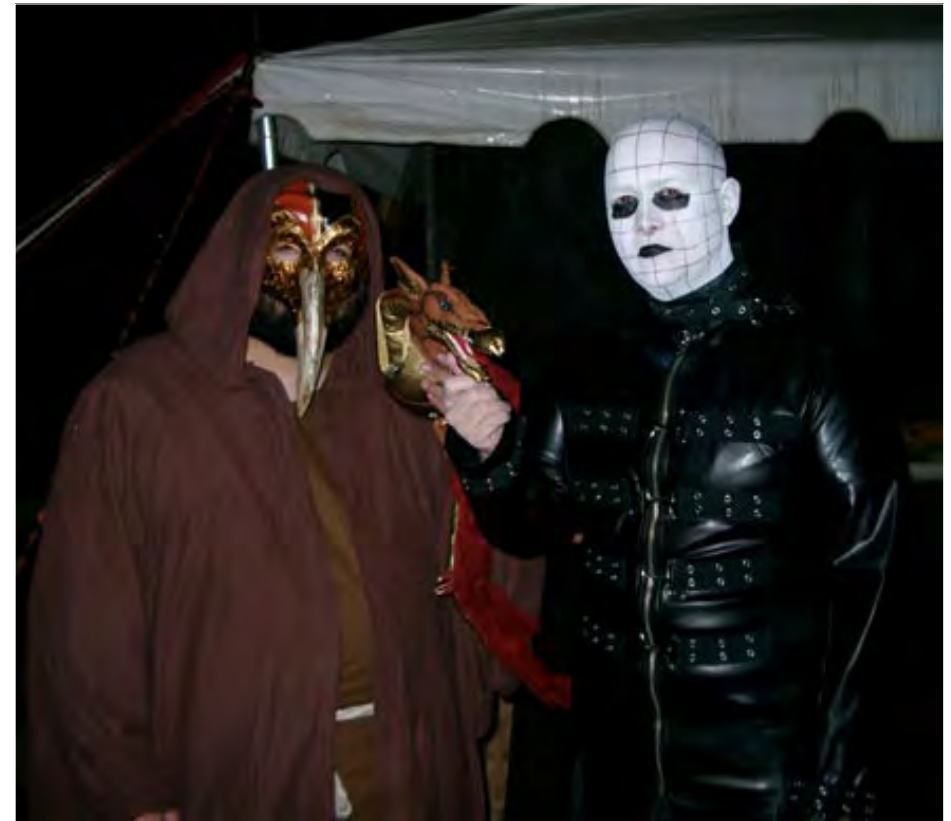
Above: some of the characters who attended the Dragon's Head Inn Haunt.