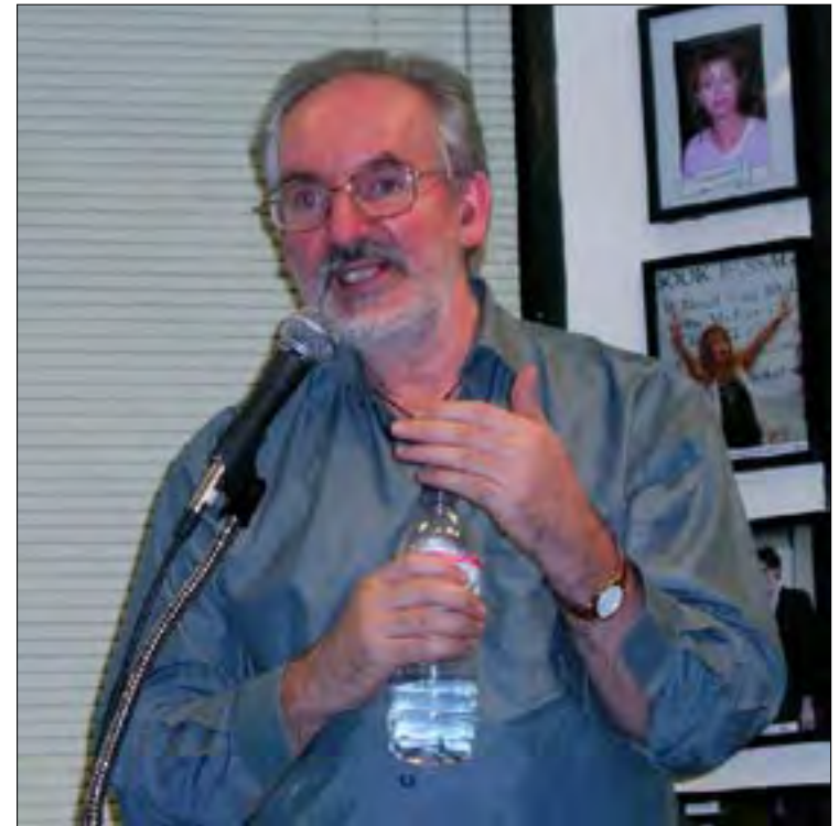
Alan Lee speaking

very specific information on the geography of locations to complete their work with accuracy and consistency. Minas Tirith and its surrounding plains are a complex environment. Lee created a sweeping panorama stretching from Osgiliath across the Anduin and the Pelennor to Minas Tirith, complete with the curves in the river where the Corsair ships would eventually be sighted. In a light touch, one Minas Tirith