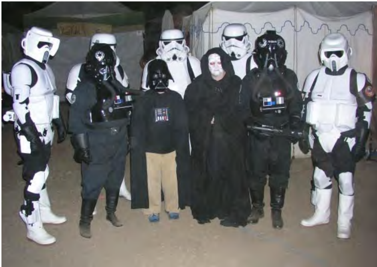
A mini Darth Vader and members of the 501st Legion