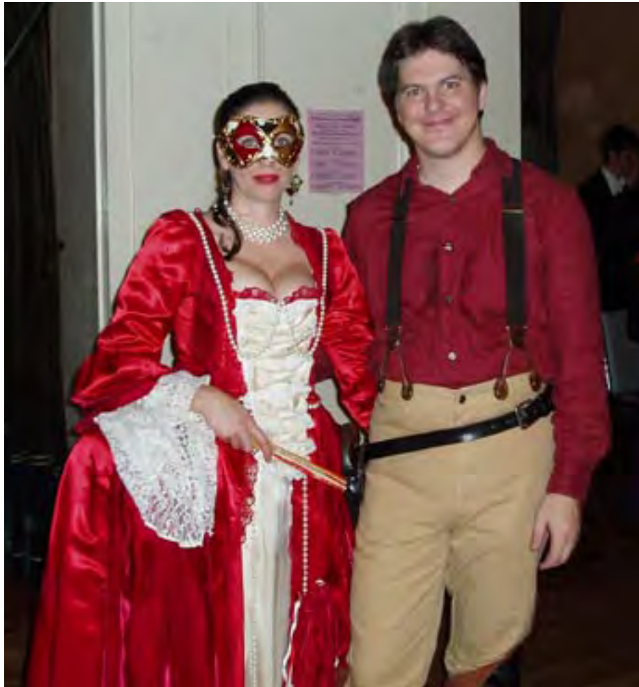
Left: Venetian Lady with Captain Mal.

that gains in speed. By the end of the dance everyone is twirling around, clapping in time and hooting over the music. Gaskells Fancy Dress Ball is a perfect night for new dancers to be introduced to Gaskells’ lively atmosphere and it is also a perfect night for all Gaskells lovers to reunite and spend the night dancing on swamp gas.