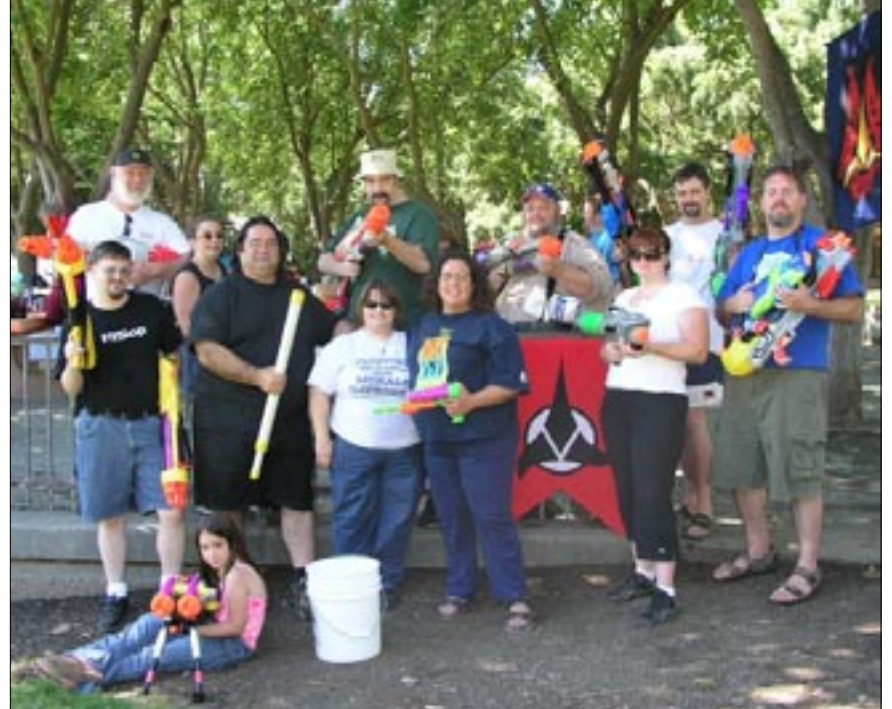
Crew of the IKV Bloodlust