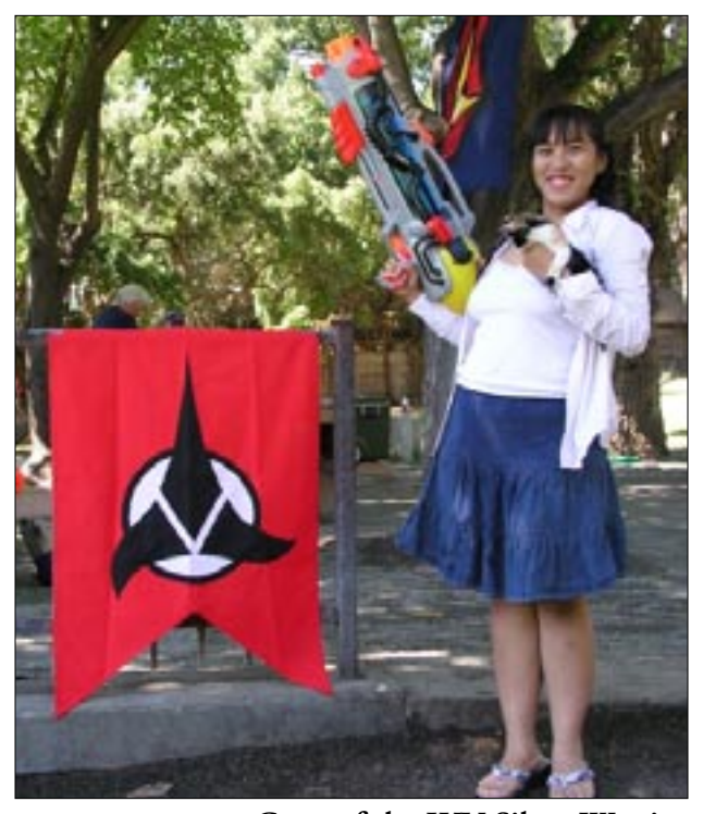
Crew of the IKV Silent Warrior

USS Augusta Ada 18pts. USS Northern Lights: 18pts.