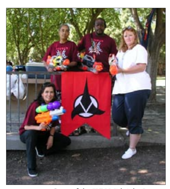
Crew of the IKV Midnight Dagger