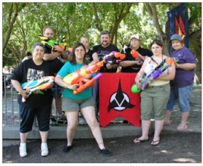
Crew of the IKV Black Dragon

Bloodlust, IKV Midnight Dagger, IKV Silent Warrior - 5pts for each ship.