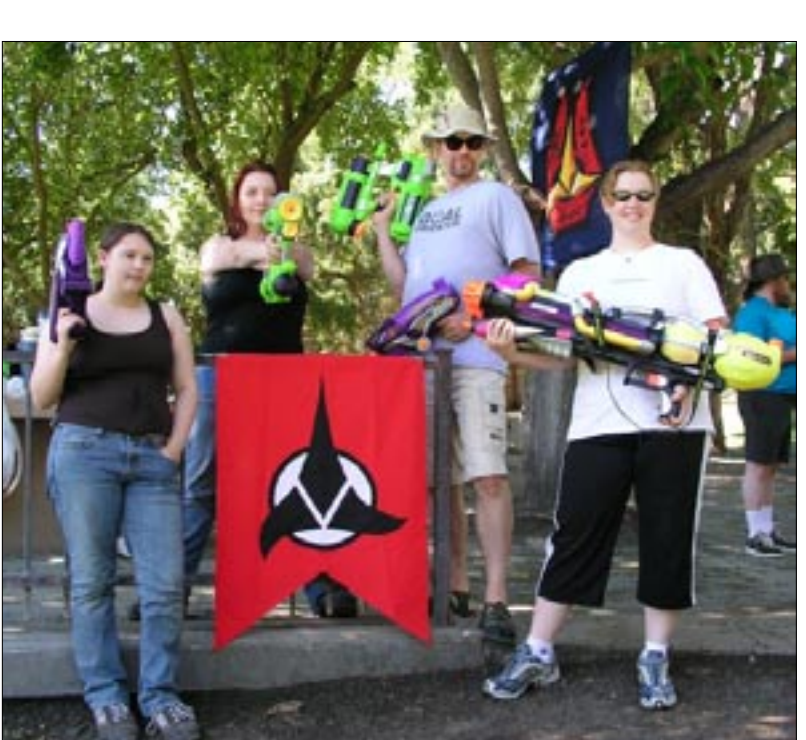
Crew of the USS Northern Lights

Game 6 was a little different. Seeing that this was going to be the last game we changed the rules. Still in effect was if you are killed you must exit the game however if you still had water in your gun or grenades to through you can return as a reinforcement. Once you are killed and out of water then you must leave the game. The Federation tried to use the strategy of conserving their water and making the Klingons waste their by killing the Feddies over and over again, it almost worked. It