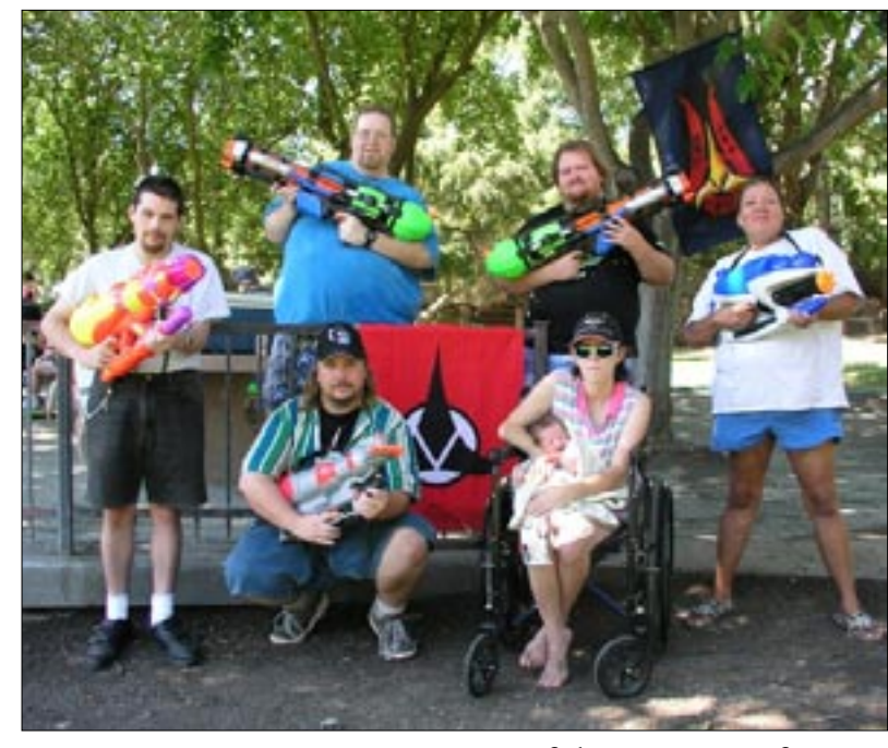
Crew of the IKV Sons of Honor