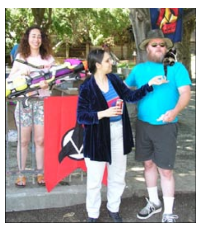
Crew of the USS Agusta Ada

Ship scores from the Artillery Competition: