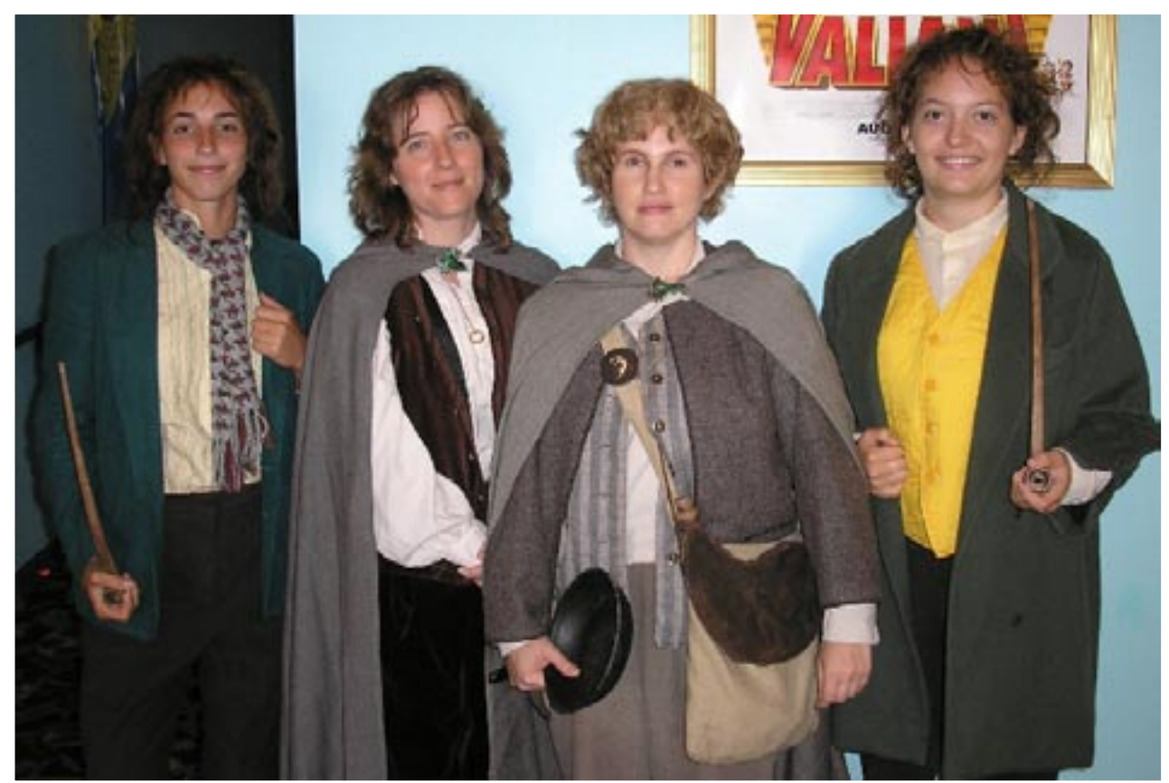
more than $2200 for Cure Autism Now. More than 150 fans, many of them in costume, attended the charity event,