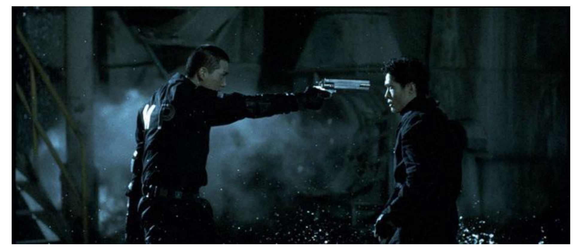
From Natural City

While not a perfect movie, Natural City is certainly an entertaining action movie The special effects here are pretty good. with a plot that depends on close to real