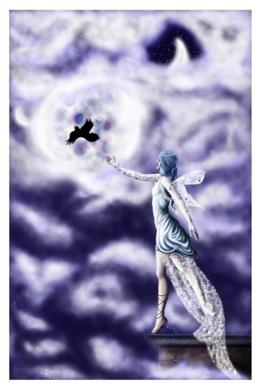
25 January 2007