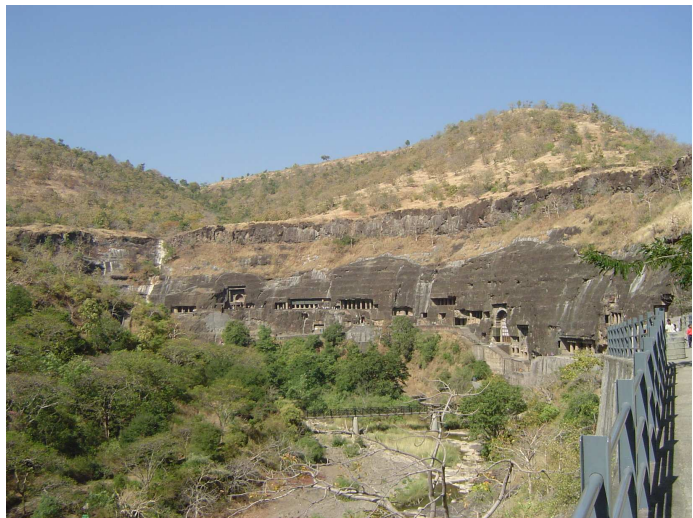
Ajanta caves (200BCE)

Temples: There must be almost as many temples as people in India. They range from a storefront too small to carry on business but containing an idol, to vast temples with many places to worship. We saw a Buddhist temple carved into a mountain in 200 BCE (Ajanta), and the new temple in Chennai (Madras) built only a couple of years ago. There are temples for Hindus, Muslims, Buddhists, Jains, Parsees, Sikhs, Christians, Jews (a synagogue in Cuchin was founded shortly after the Dias-