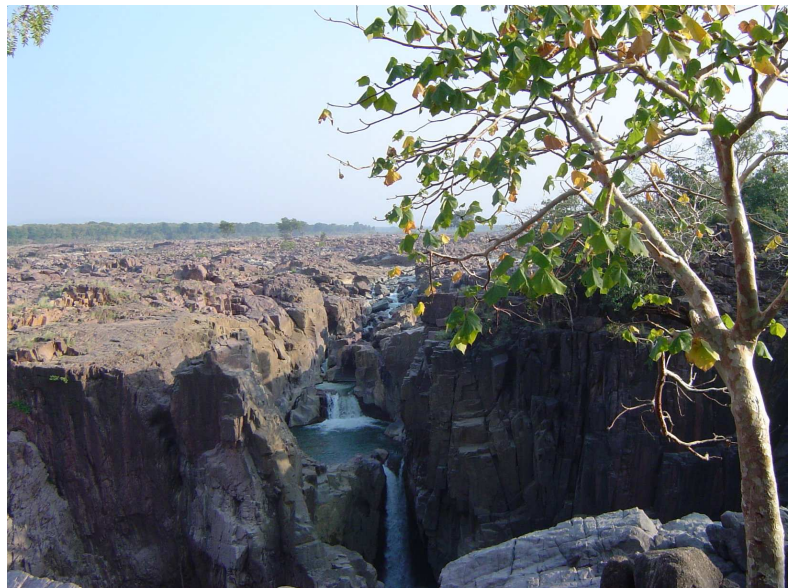
In a park near Khajuraho

Food: It's easy to be a vegetarian in India, and after trying a chicken that seemed to have died of starvation, we ate vegetables. I lost 5 pounds; Janet gained 5.