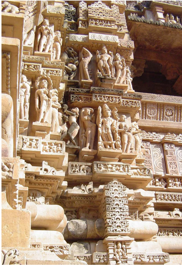
Khajuraho: sculptures everywhere

At the Sound and Light show, we sat down in the near-dark. As the show started, we were a little overwhelmed to realize we were surrounded by the temples. The program went into the history of the temples (tenth to thirteenth centuries); well-done.