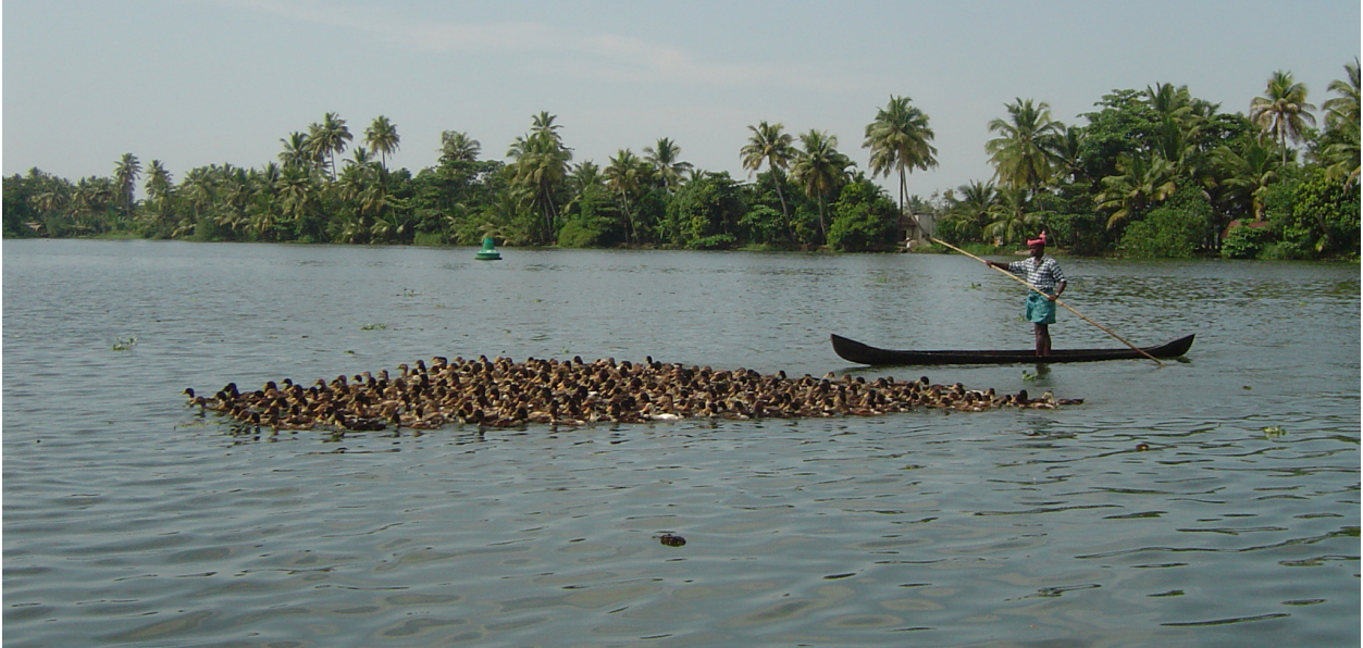
Herding ducks in Kerala backwaters

war on each other. Some of the palaces, now too costly to maintain, have become hotels.