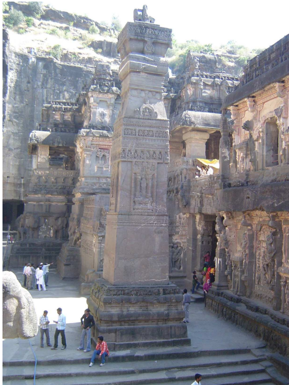
Kailasa Temple in Ellora (750CE)

The temples at Ajanta and Ellora are carved into lava. The earlier Buddhists made caves but the Kailasa Temple is an amazing monolithic building, the outside stone fully removed. Ajanta is farther from the roads, beautiful in its setting. Its cave temples include a huge recumbent Buddha. Temples carved from rock were done in several other places, notably at Mamallapuram in Tamil Nadu.