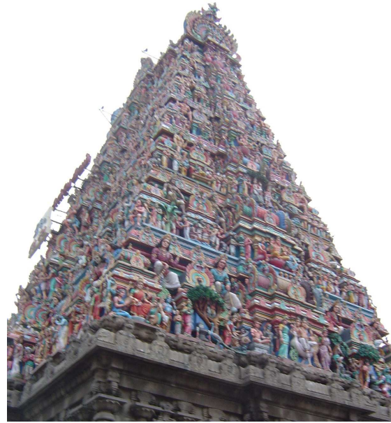
Temple in Chennai (2002)

In the temple in Madurai, Shiva visits Parvati each night; priests ceremonially carry him on a palanquin, to carry out marital bliss. (The palanquin is covered—was it an idol or only his lingam?) Thousands of years old, he still gets laid every night.