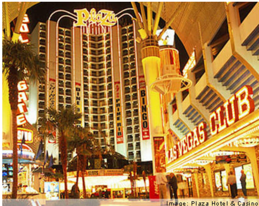
Image: Plaza Hotel & Casino

But don't forget: if the price is right, you can fly into Canada, then change planes for Las Vegas. Look