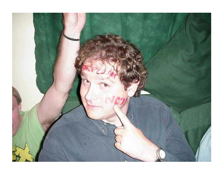
"What the #@~!?" - me