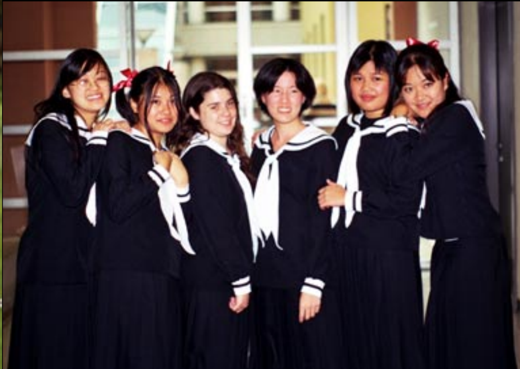
Upper Right: AnimeDestiny convention staffers pose as characters from the Maria-sama ga Miteru Managa.