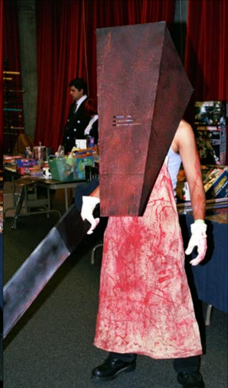
A Pyramid Head from the video game Silent Hill .