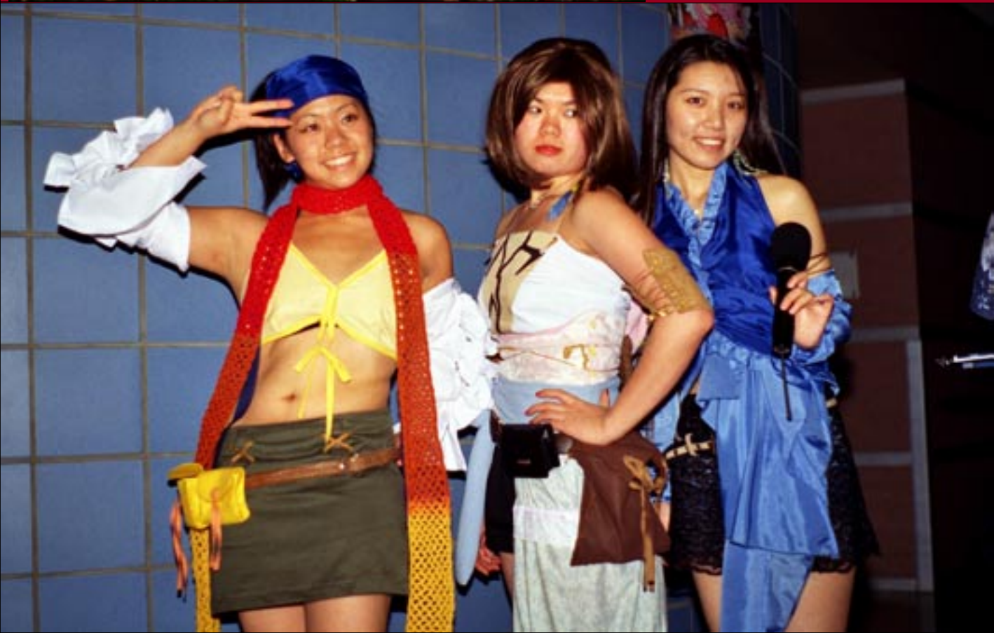
Left to Righth: from the Final Fantasy X-2 video game are Rikku, Yuna and Lenne