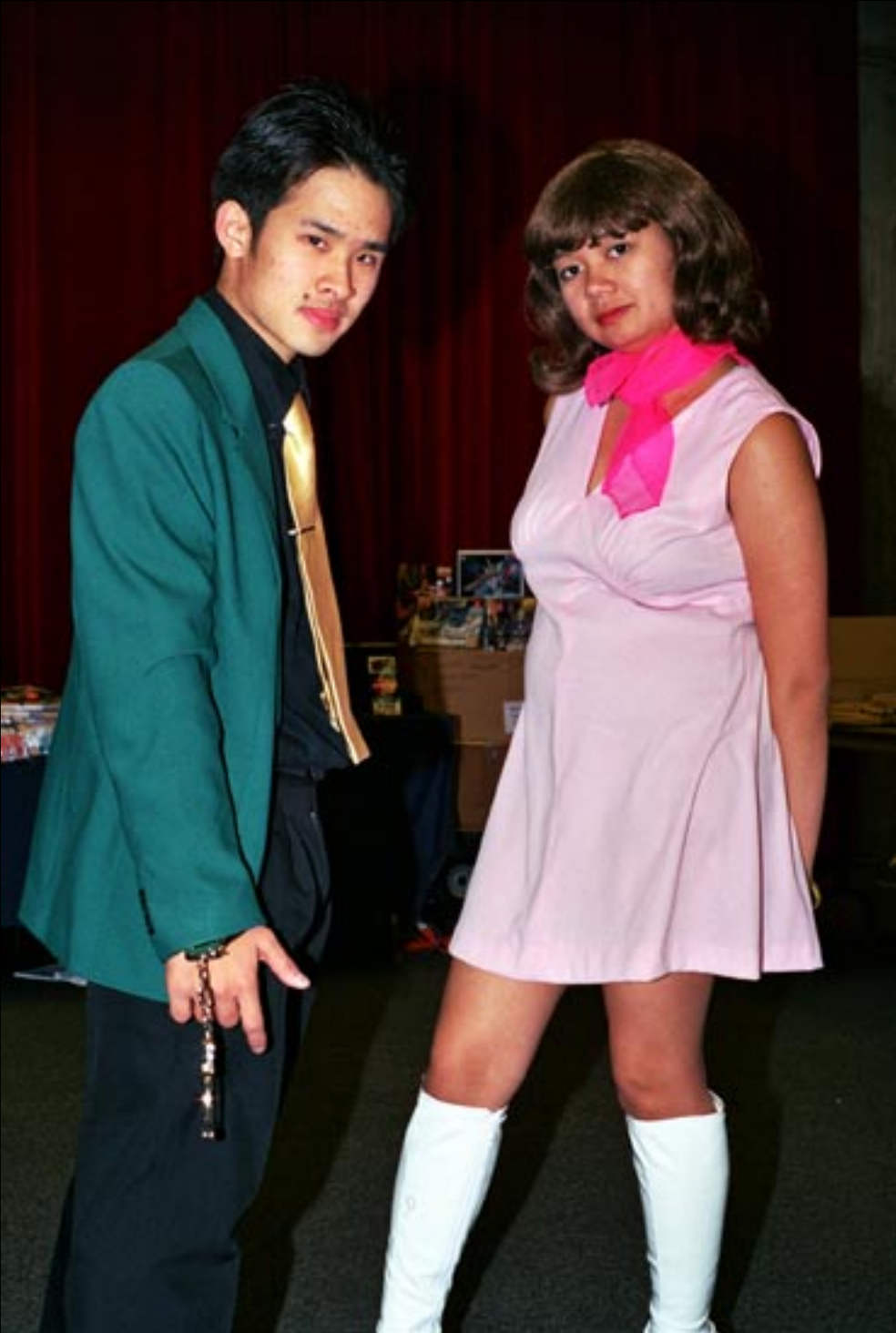
Traveling Valentine presents Lupin III and Fujiko Mine from the Lupin III series.