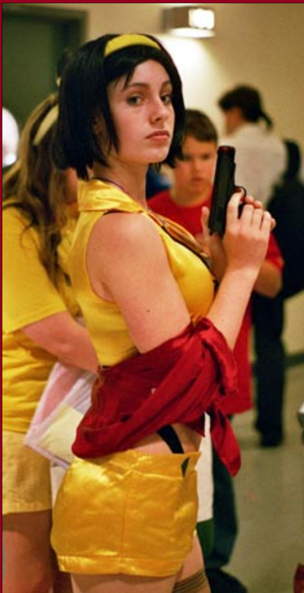
Faye Valentine from the anime Cowboy Bebop .