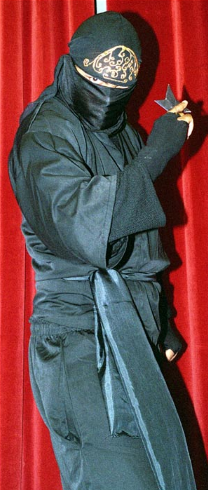
A generic stock-company ninja.