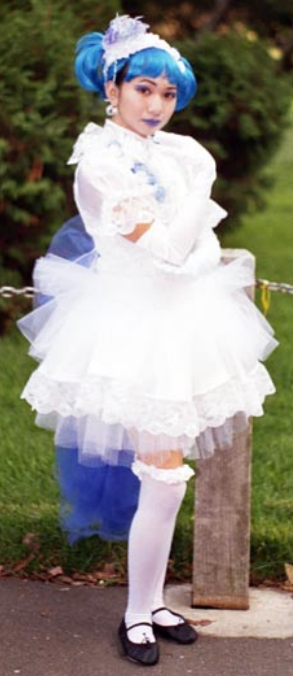
Mana, a J-Rock recreation, took this cosplayer all summer to create.