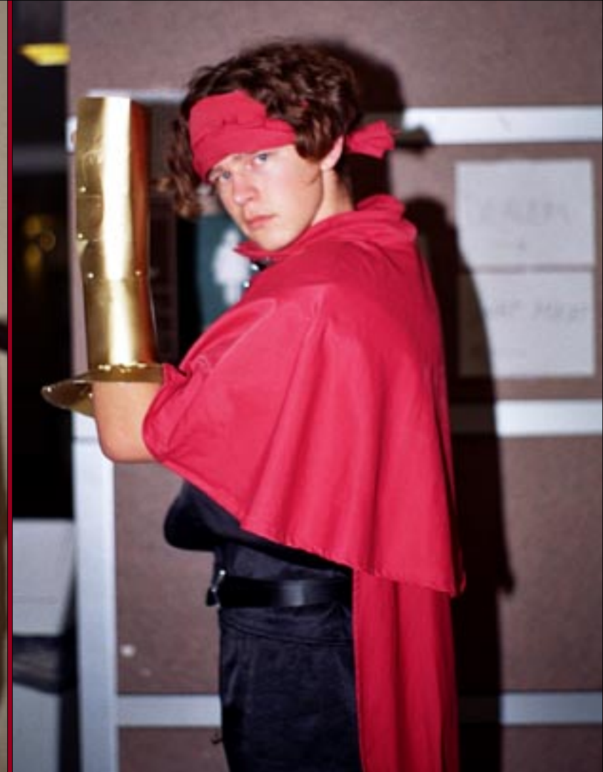
Vincent from the video game Final Fantasy 7 .

Pimp Mario and Whore Peach: an original interpretation of the Nintendo video game characters..