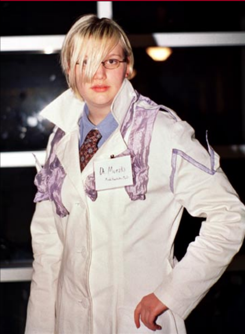
Above: Astro as Dr. Muraki from the anime and manga Yami No Matsue .