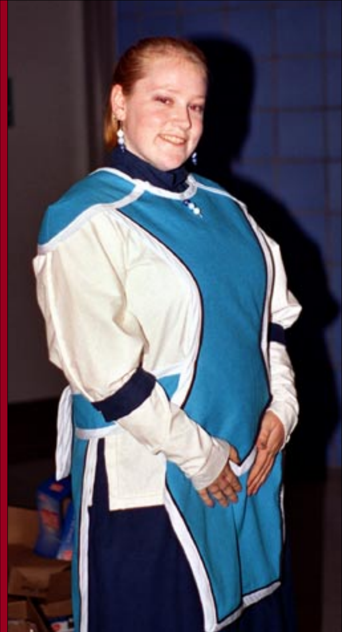
Sarah from Suikoden 3 .