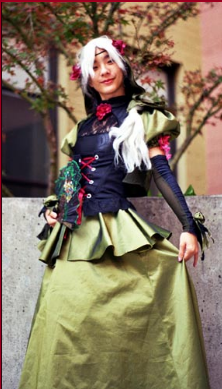
Pegasus Maiden models her Jibrille outfit in the courtyard near the convention site. The character is from the manga and anime Angel Sanctuary .