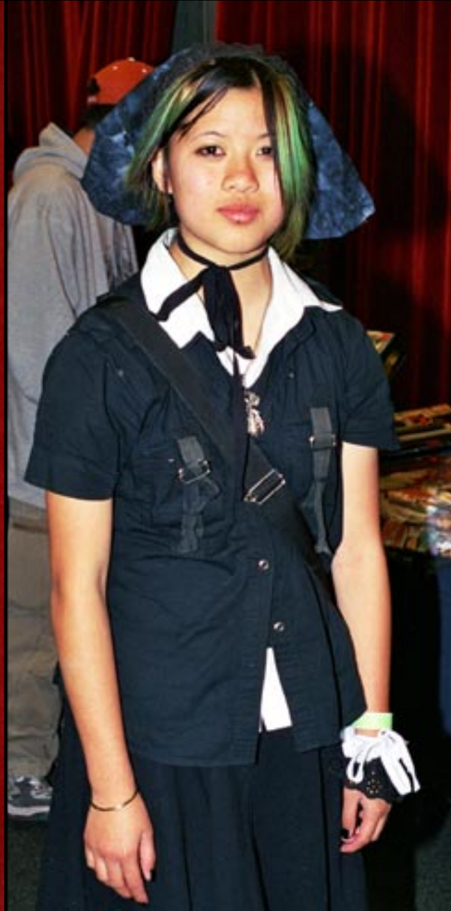
She said this is not a costume, this is a normal outfit.