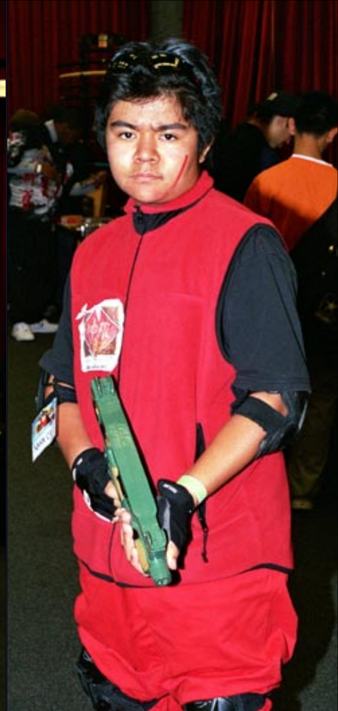
From Final Fantasy 7 — a member of the Shinra Attack Squadron.