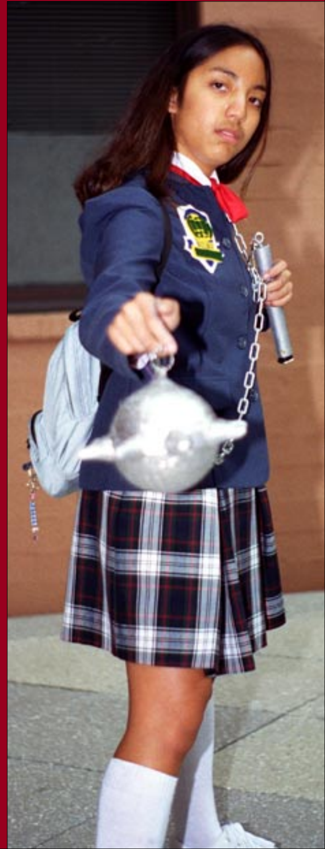
GoGo Yubari from the live-action film Kill Bill .