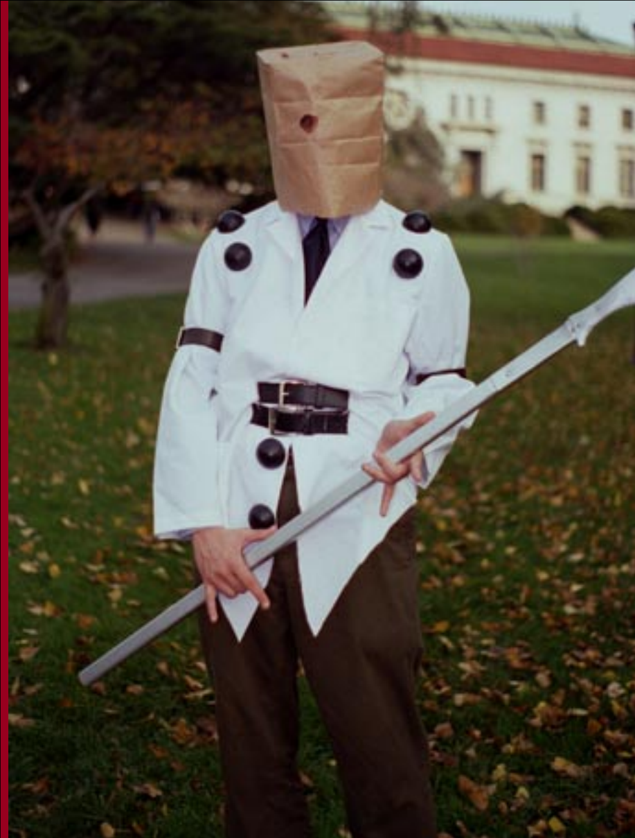
Faust from the Guilty Gear X Video Game.