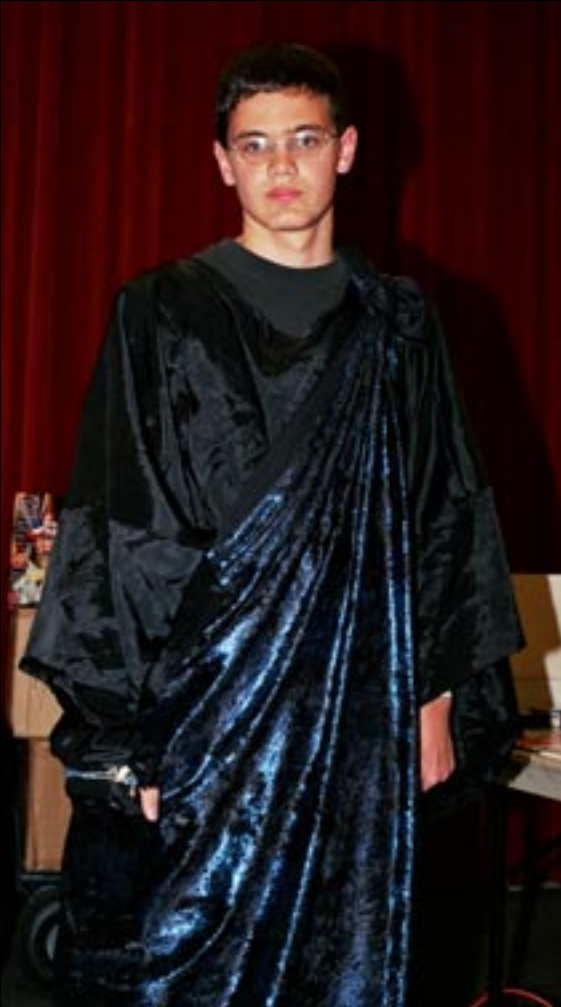
Left: Miroku from Inu Yasha .