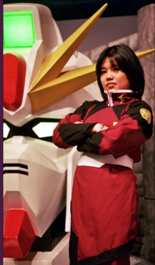
Standing with the to-scale Gundam head at the Bandai store are members of Cal-Animage Alpha. From Left: Milly, Shin and Athrun, all characters from Gundam Seed or Gundam Seed Destiny. Below: Cagalli, Athrun, Lacus, Milly and Shin.