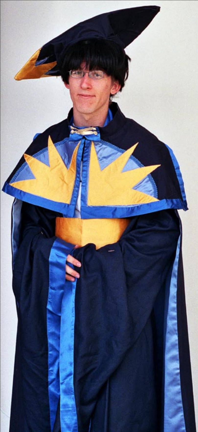
Arial from the series Card Captor Sakura.