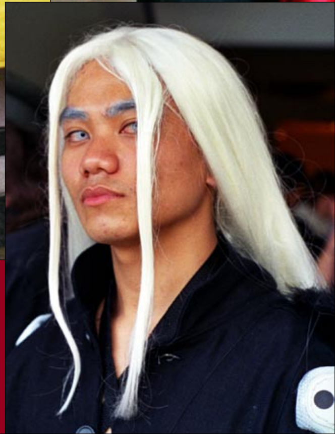
Above and Right: Sephiroth from Kingdom Hearts.