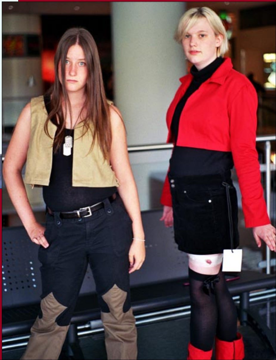
Brandon Heat and Asagi Mika, both from the anime of Gungrave.