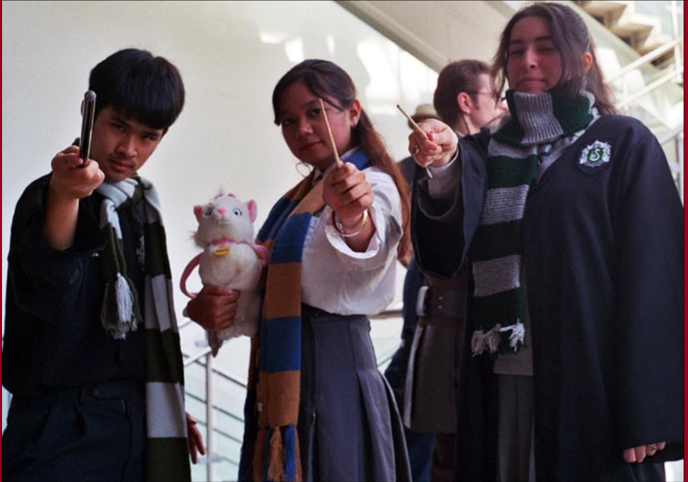
Above: a trio from Harry Potter. Below: L to R: A character from Prince of Tennis, two from Battle Royal.