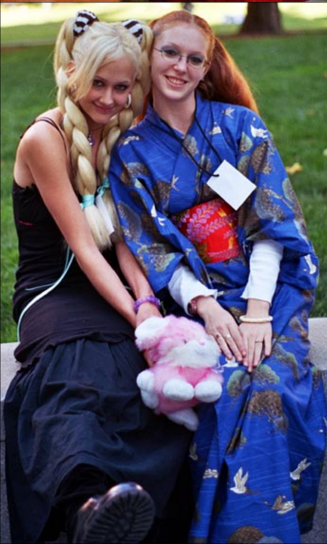
Left: Original creations.