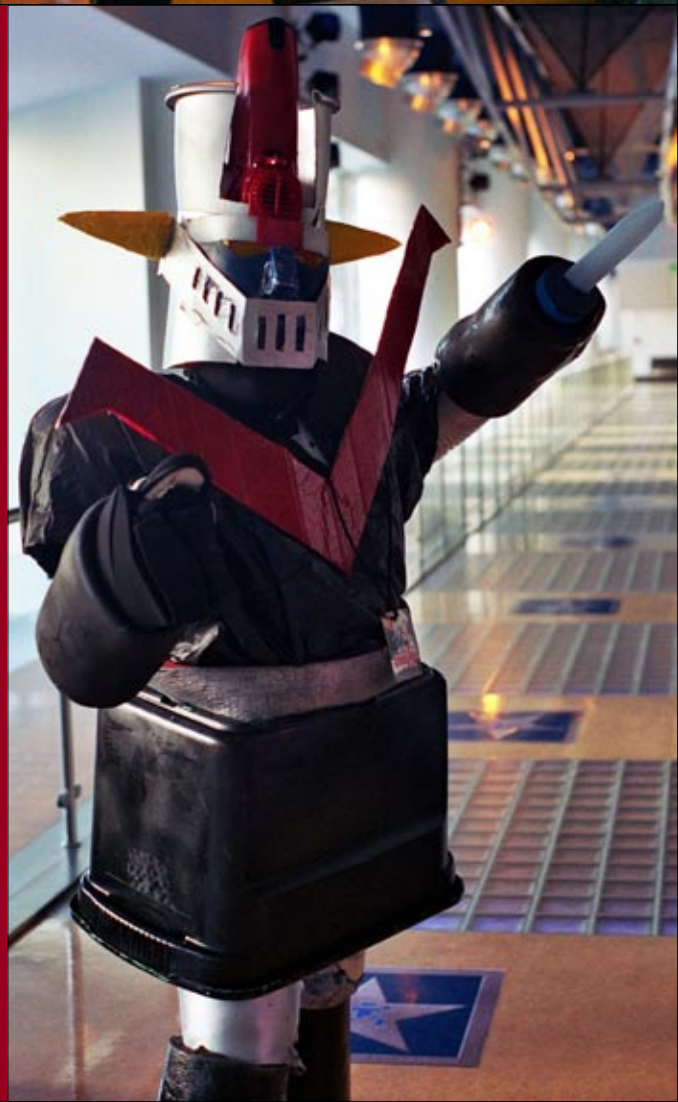
Right: An old-school mecha.