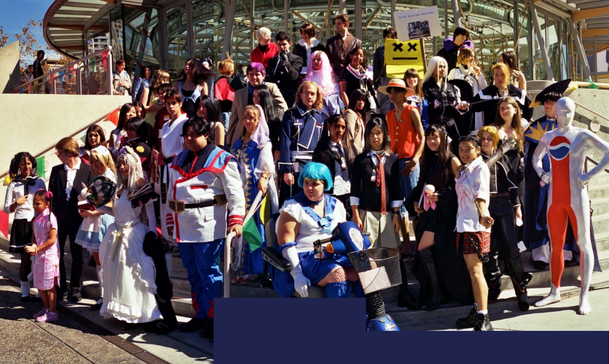
Cosplayers gather in front of the Zeum for a group photo shoot.