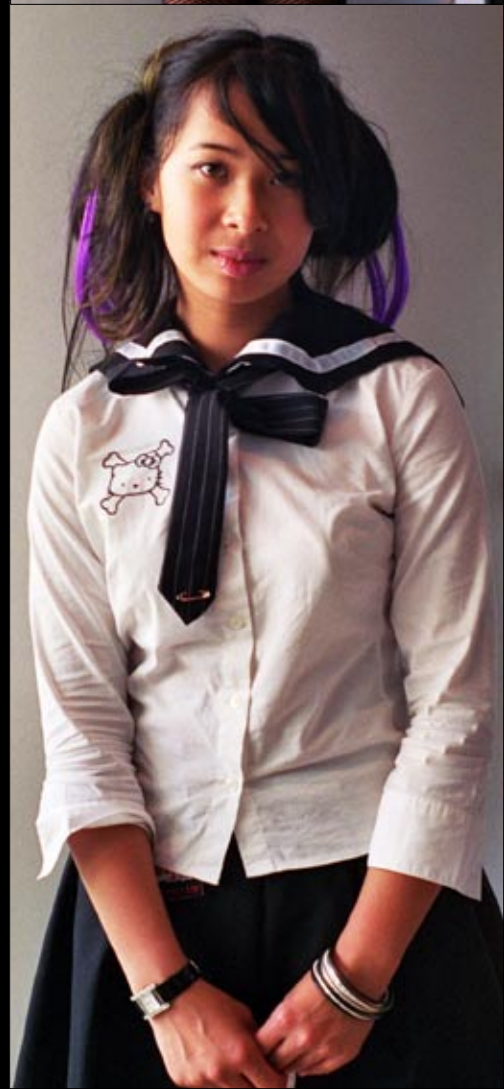
Right: An original Elegant Gothic Lolita outfit.