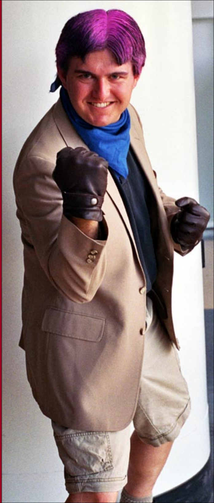
Right: Trunks from Dragon Ball GT.