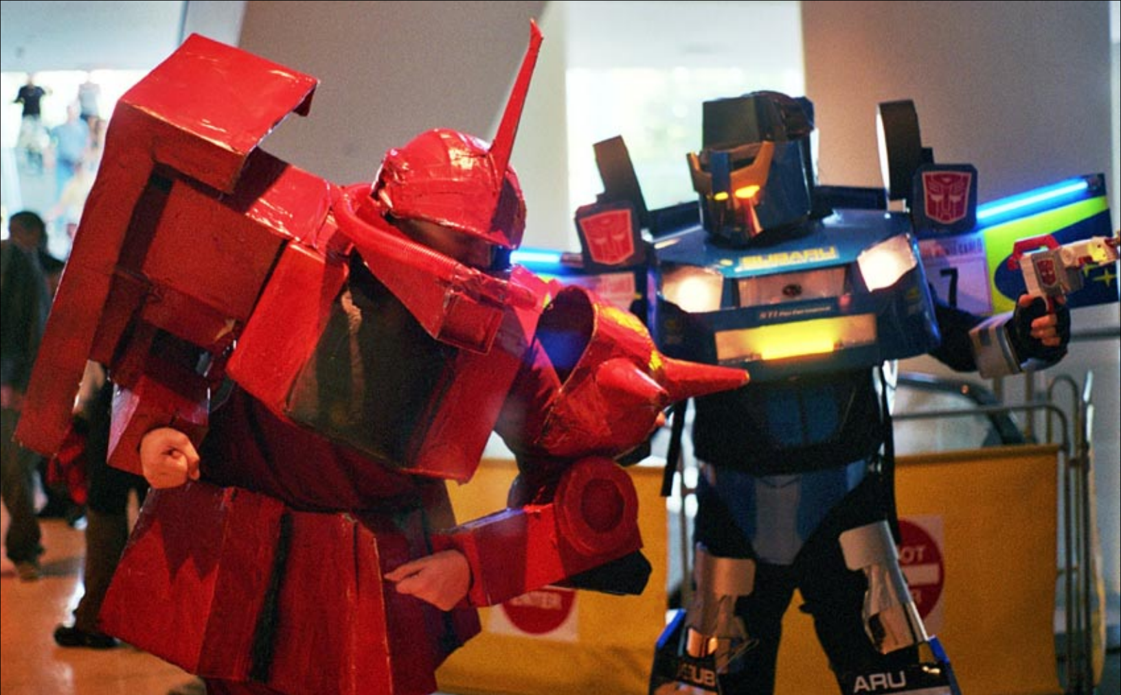
Above: The Red Comet from Gundam mixed it up with Transformer Smokescreen from Transformers.