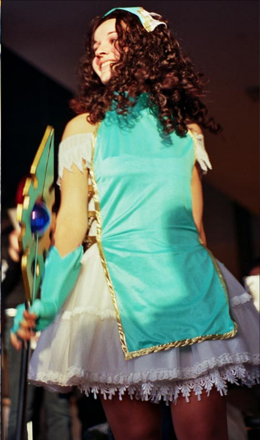
Chocolate Misu from the anime version of Sorceress Hunters.

Cosplay Magazine Issue Four October 2004