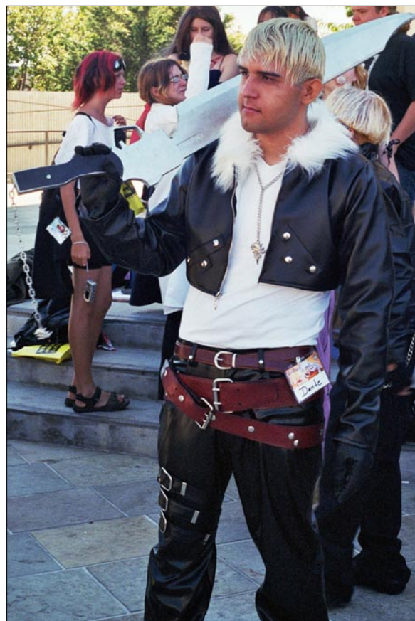
Top, Bottom Left: Selphie, Top Right: Squal Leonard, Bottom Right: two Yunas, all from Final Fantasy