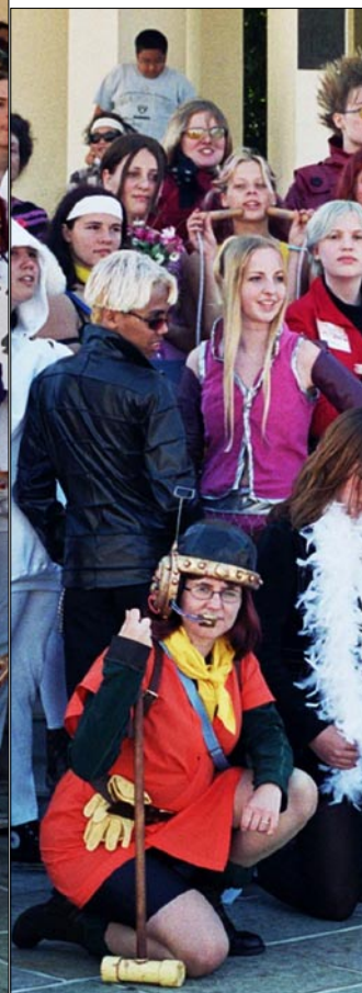
Left: I think these guys are just in kimonos.