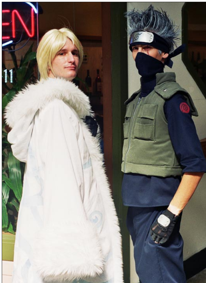
Left: Fai from Tsubasa by Clamp with Kakashi from Naruto.