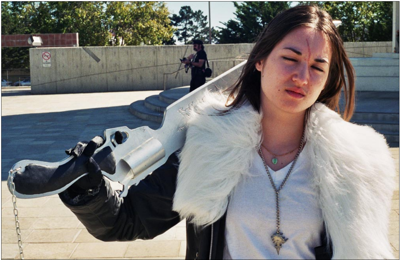
Above: Squal Leonard, Bottom: Squal, Vincent and Sid, all from Final Fantasy