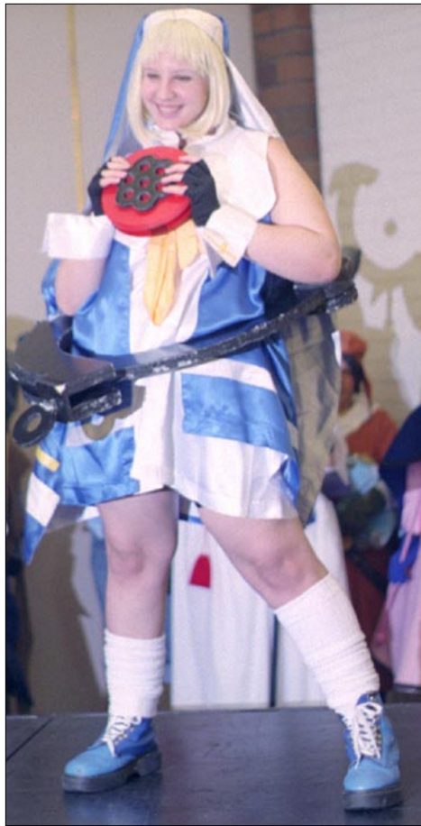
Left: Bridget from Guilty Gear X