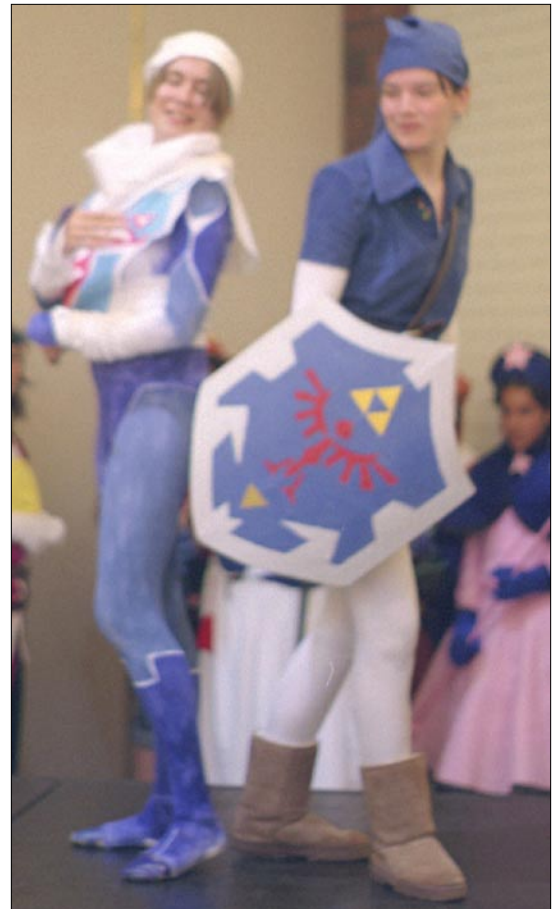
Right: From Zelda