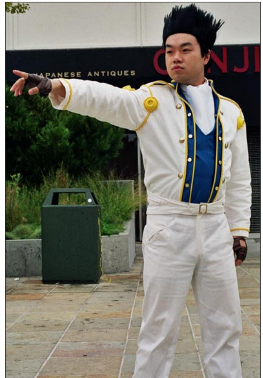
Lower Right: Asagi Mika from Gungrave