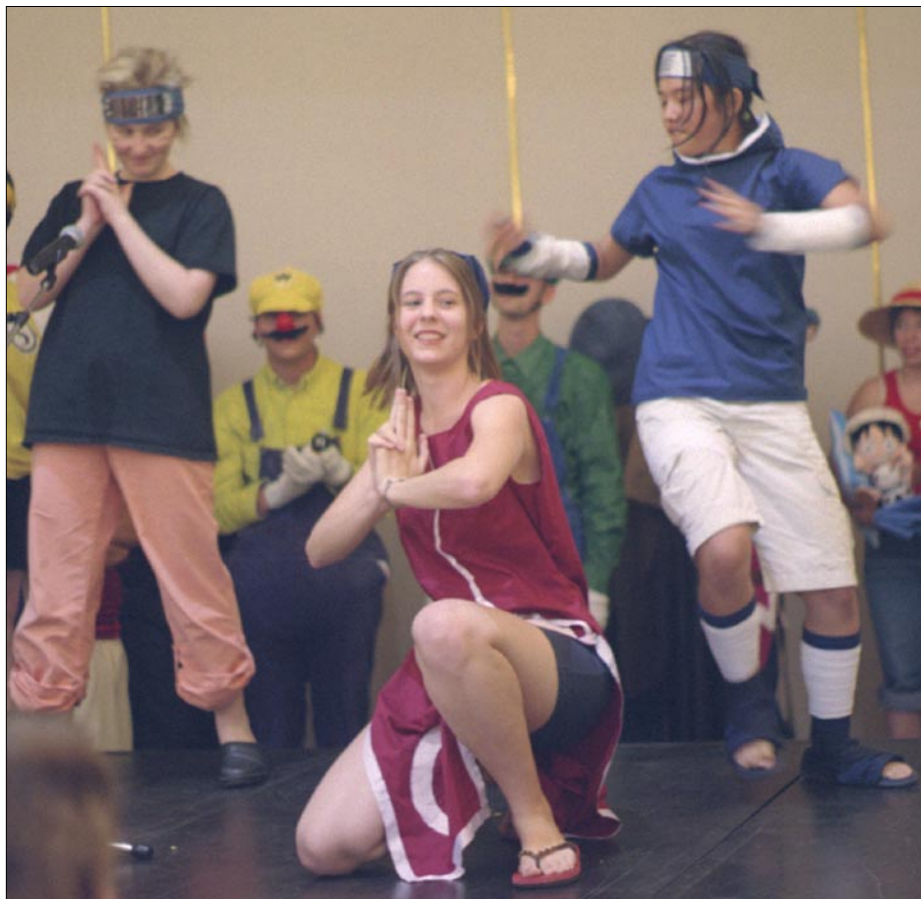
Team Seven from Naruto: