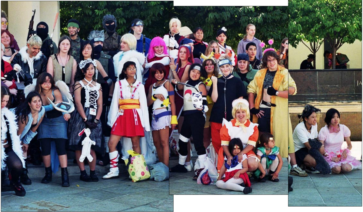
Above: the group photo shoot on Saturday. Below: A group of Final Fantasy/Square characters.