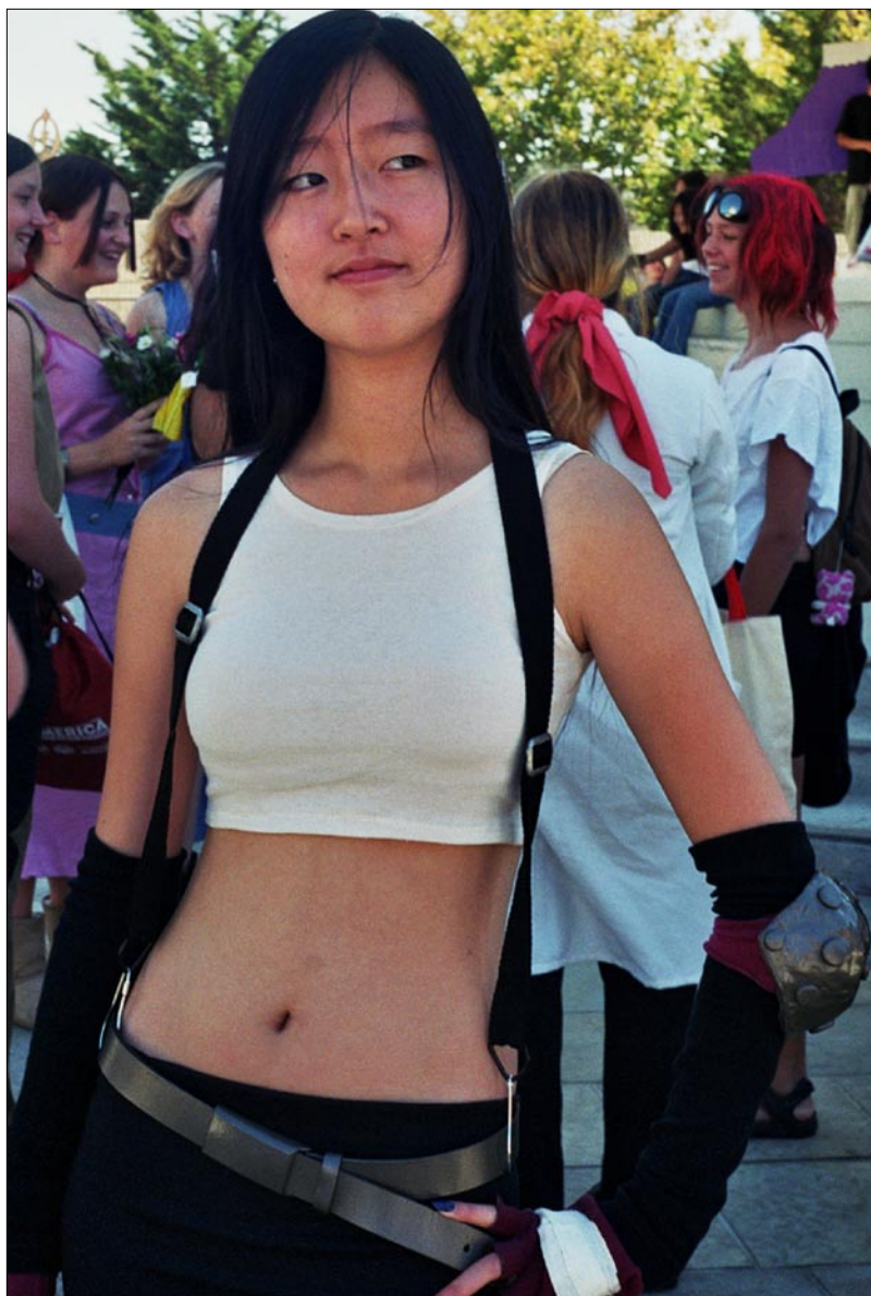
Left: Tifa from Final Fantasy VII.

Below: A terrific version of Deedlit from Record of Lodoss War. My personal favorite of the con. It's one of my favorite series, and I've never seen anybody do a character from it.