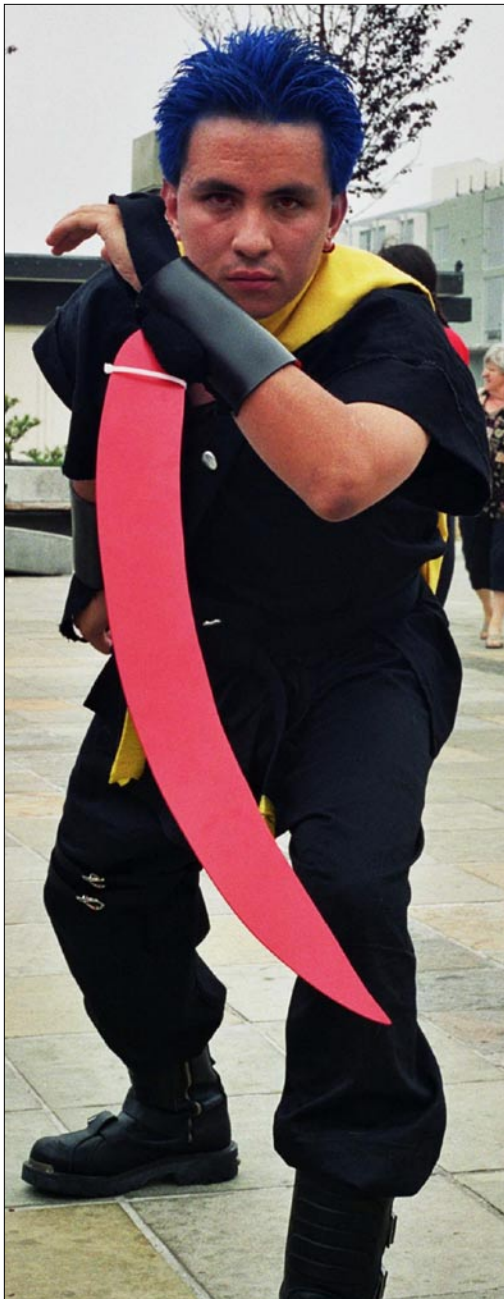
Top Right: Ogami from Sakura Wars