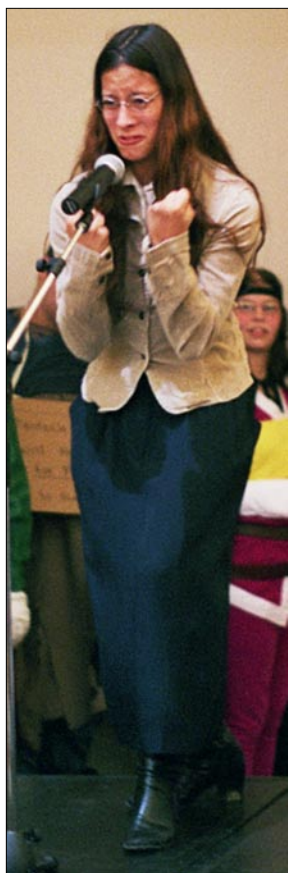
Left: Yomiko Readman from Read or Die