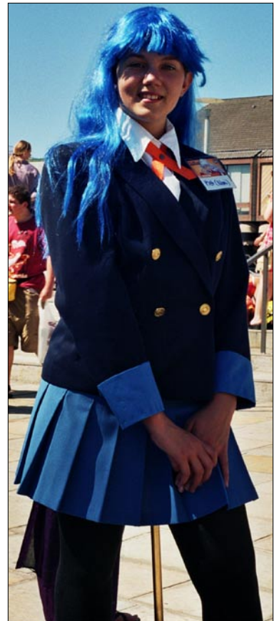
From Left: Luka, from Chrono Trigger, won for Best Classic Costume. Quistis Trepe from Final Fantasy 8 in pink. Mizaki from Magic Knight Rayearth, Below Left: Spike Siegle from Cowboy Bebop. Center, 3/4 of the crew of the Bebop. Edward from Full Metal Alchemist.