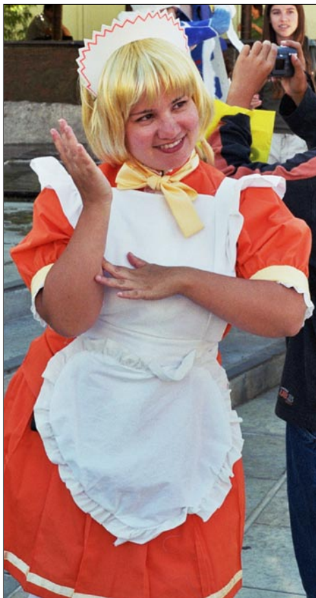
Haruko from FLCL