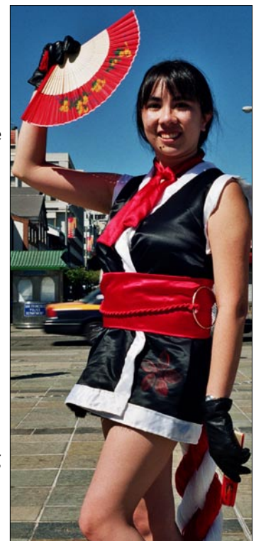
Right: Mai Shiranui from King of Fighters