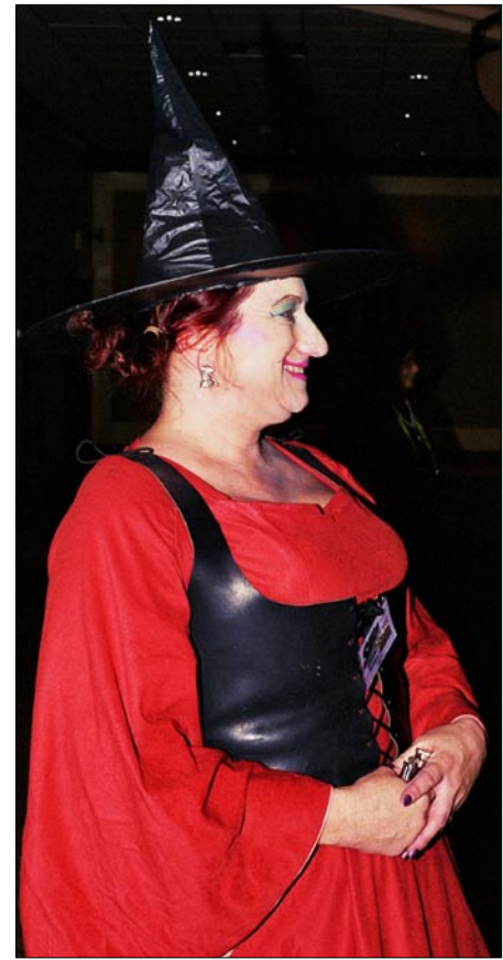
The Mayor's Wife from The Nightmare Before Christmas

One quibble I had is that they didn't have a schedule posted in advance, something that made planning a bit difficult.