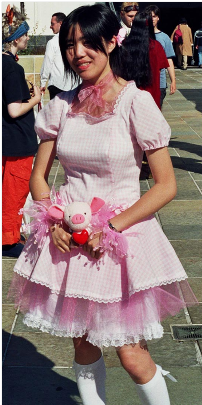
Elegant Gothic Lolitas

Lain, top photos, was seen as Gackt at Tales of Anime in issue two.