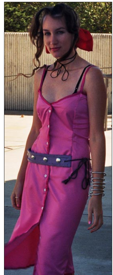
Aerith from Kingdom Hearts