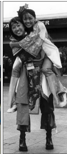
Left: Zhou Yu from Dynasty Warriors