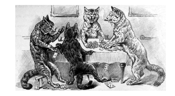
Lloyd Penney, 1706-24 Eva Rd., Etobicoke, ON, M9C 2B2, penneys @ allstream.net, April 30, 2008

((Me, I define science fiction as books, or short stories, words on paper; I don't expect much from TV or film versions of SF. I define conventions as one of the few places I can enjoy socializing, and not often even at conventions, anymore.))