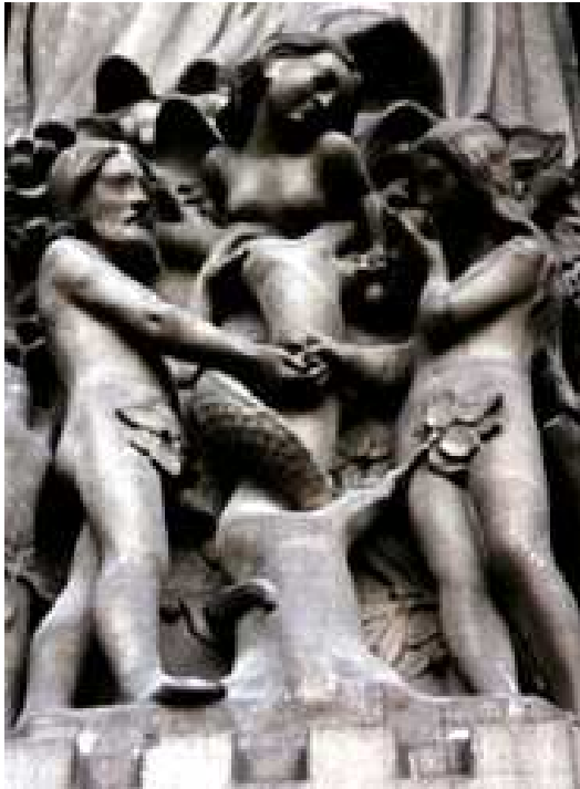
Adam, Lilith, and Eve relief sculpture, c. 1210 CE

Base of trumeau, left portal, West Façade, Notre Dame, Paris