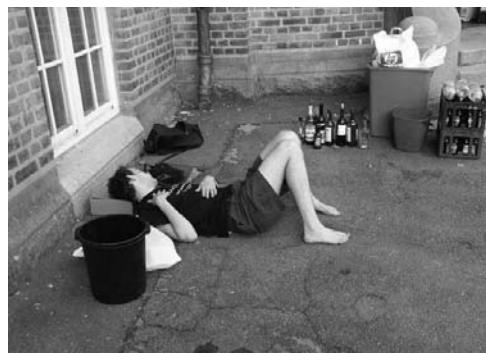
Figure 8: Debconf3, Oslo, Norway 29

At the airport, awake but often a little dazed, participants engage in one final conversation on technology, usually mixed in with re-visit-