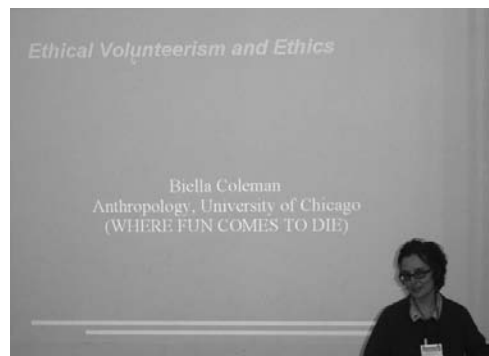
Figure 4: Debconf4, Porto Alegre, Brazil 19

to stay awake to attend the talks. Though many talks are on technical matters, they usually span multiple topics: legality, politics, cooperative sociality, and even the anthropology of their project.